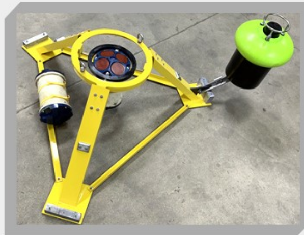
Above: Tri-Pod with RDI and Pop-up Buoy