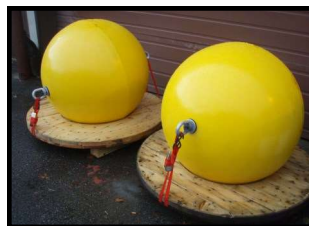
Spherical Mooring Floats with Center Strength Member and Mooring Eyes